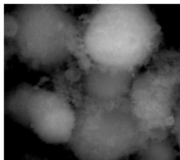
Near Spherical 1-10µm