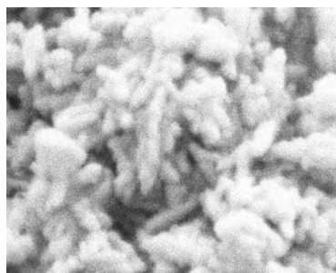
Rod-Shaped 60x150nm avg.